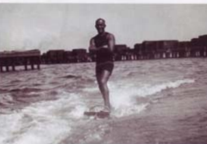
George Freeth is known for one of the people who introduced surfing to California for the first time. Same as Duke, he is a great water man who grew up in Waikiki.

Surfing may never have grabbed the publics and surfers imaginations any