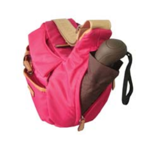
Small umbrella can be put pocket on the right side gusset.