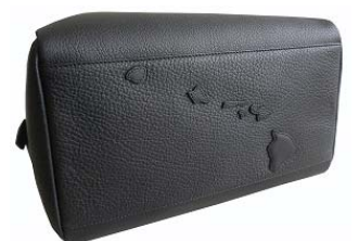
Lanai Transit Hawaii Island logo.