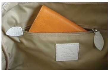
Long zipper poket in the main room.