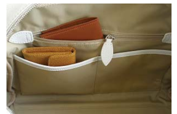
Useful organizer in the main room.