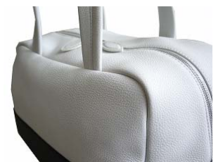
Using high quality French leater "DU PUY".