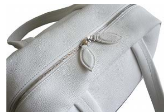
Comfortable leaf desigh zipper slider