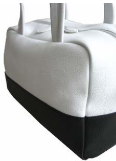
2 tone color design.