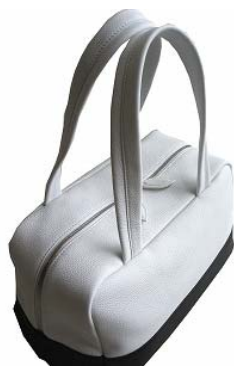
Comfortable soft handles.