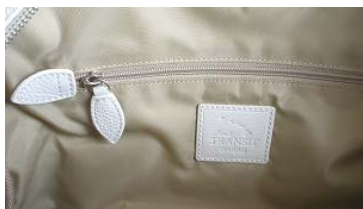
Using high quality leather for inside the bag as well.