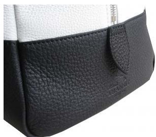
Lanai Transit Hawaii logo.