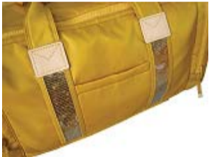
Small pocket on the front panel.