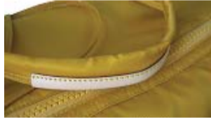
The handle reinforced by Italian leather.