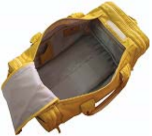
The flap close by double zipper and fastening tape.