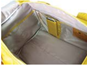
Useful organizer and many of small pockets inside the bags.