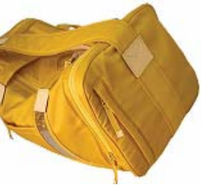
Zipper pocket on the right side gusset.