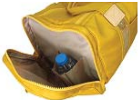
Bottle stand inside zipper pocket.