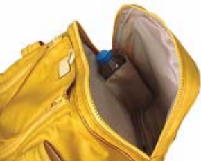
Bottle stand inside zipper pocket.