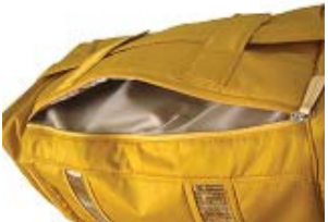
The gusset bottom has a fastener pocket for umbrella.