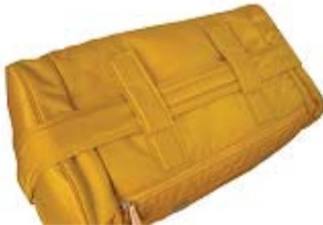
The shoulder belt holder on the bottom.