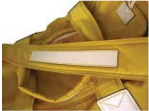
Comfortable wide shoulder strap.