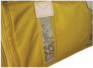
Delicate spangle part is covered by transparent PVC.