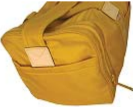
Small pocket on the left side gusset.